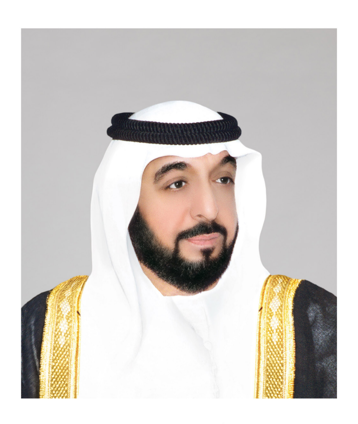
المغفور له بإذن الله الشيخ خليفة بن زايد آل نهيان تغمده الله بواسع رحمته SHEIKH KHALIFA BIN ZAYED AL NAHYAN