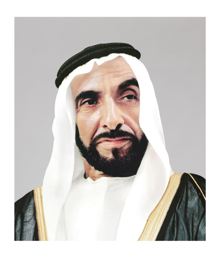
المغفور له بإذن الله الشيخ زايد بن سلطان آل نهيان تغمده الله بواسع رحمته SHEIKH ZAYED BIN SULTAN AL NAHYAN