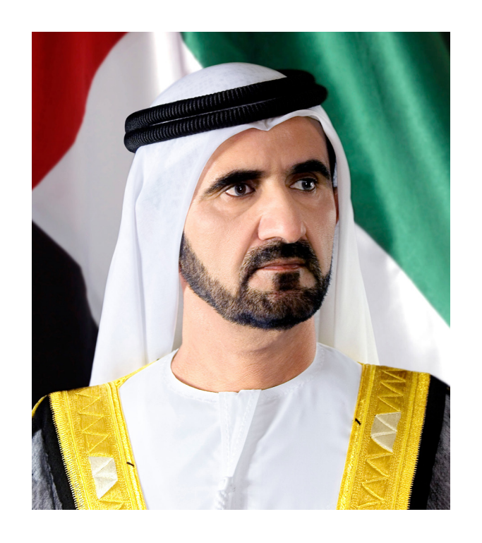
صاحب السمو الشيخ محمد بن راشد آل مكتوم نائب رئيس الدولة - رئيس مجلس الوزراء، حاكم دبي