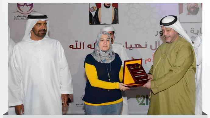
In the presence of HE Saeed Bin Tahnoon .. AAU participated in the event "Mother you are all Kind of Amazing"