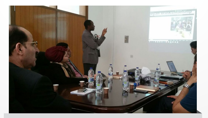
Lively Discussion about "Press Reader" at Khalifa Library