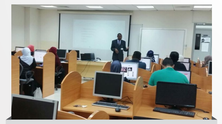
Khalifa Library Organizes a Workshop on Search Skills and Research Management