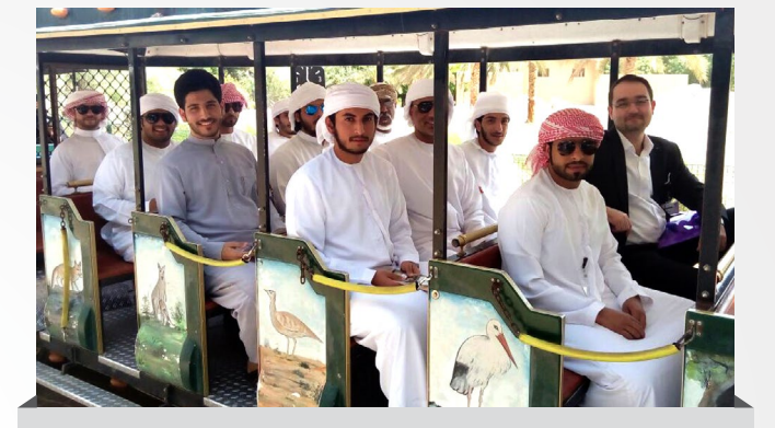
Student's visit to Sheikh Zayed Desert Learning Center