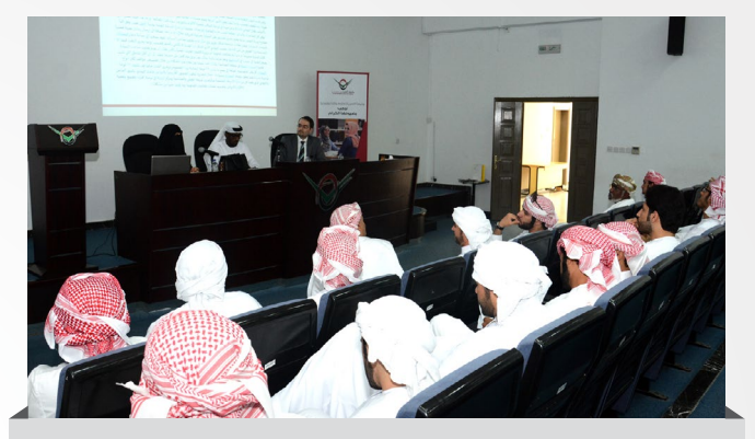
AAU hosted Al Ain City Municipality to talk about its role in preserving the environment