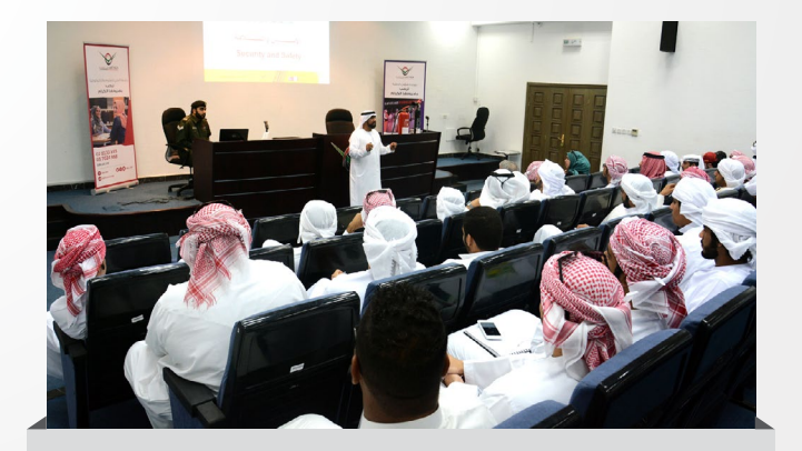
Awareness lecture about "Fire protection" in AAU