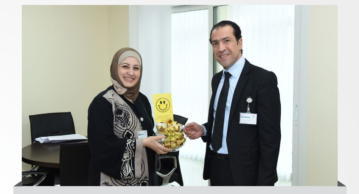
AAU celebrates the International Day of Happiness