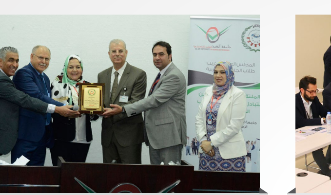
AAU Concluded the 23rd Forum of Exchanging Training Programs for Students of Arab Universities