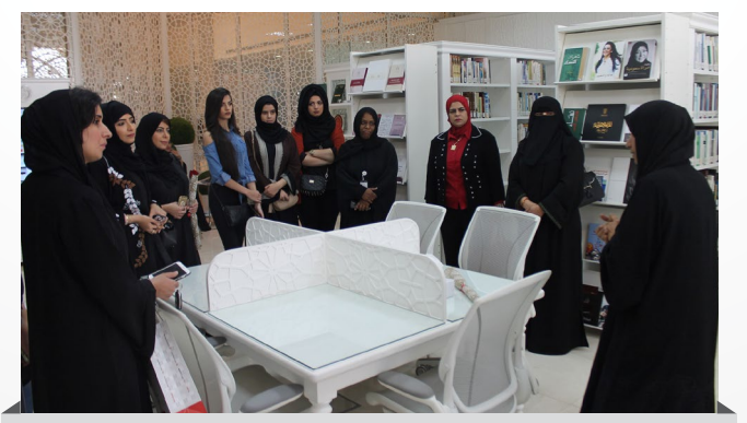
AAU Students visits the General Women's Union