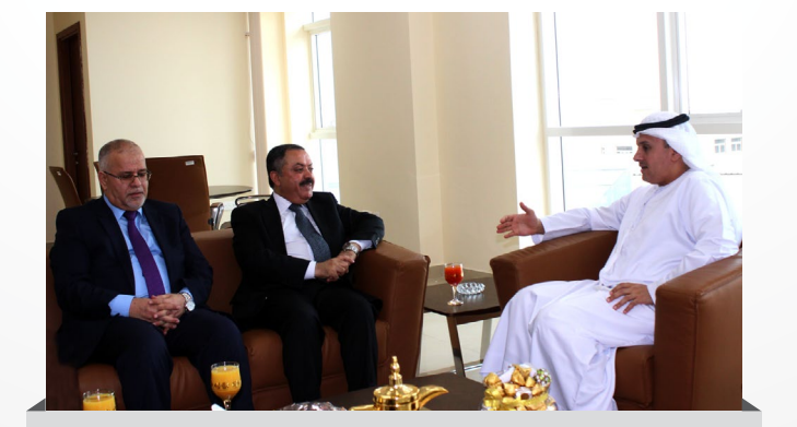
AAU Chancellor receives Jordanian Ambassador to UAE