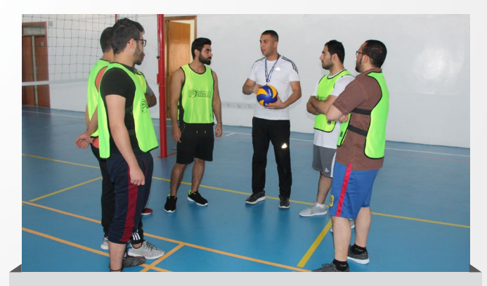
Enthusiastic and Competitive Volleyball Championship for Colleges