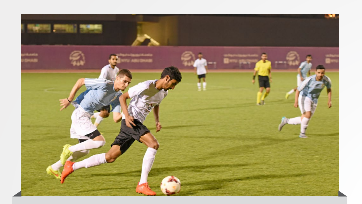
AAU Football Team Beats Al Hisin Team