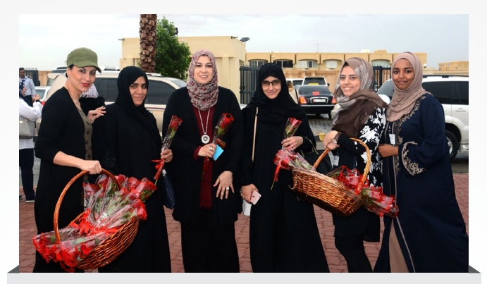
The Deanship of Student Affairs Celebrates the Mother's Day