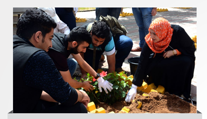
AAU raises a slogan "Plant a tree, Reap Fruit"