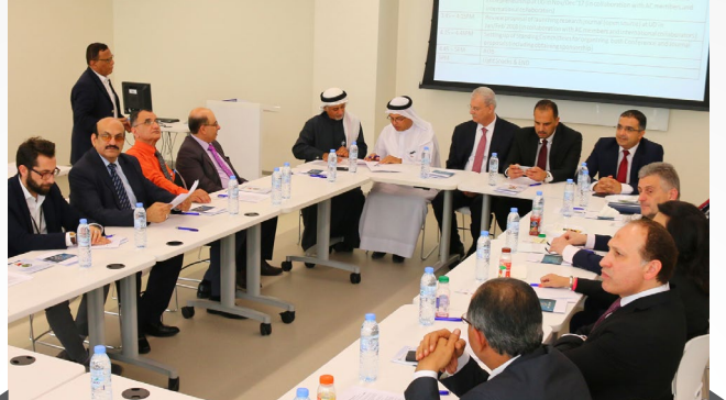
AAU signed MOU with Different Universities in UAE