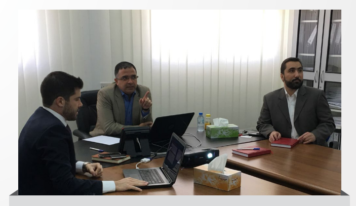
A Workshop about "Scientific Research Resources" for Engineering Programs