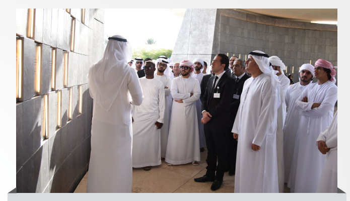
A Delegation from AAU visit "Wahat Al Karama"