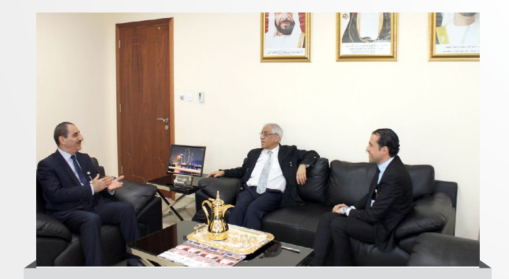
A Delegation from Lyon University visits AAU