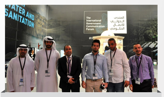
Student Delegation visits Government Communication Forum